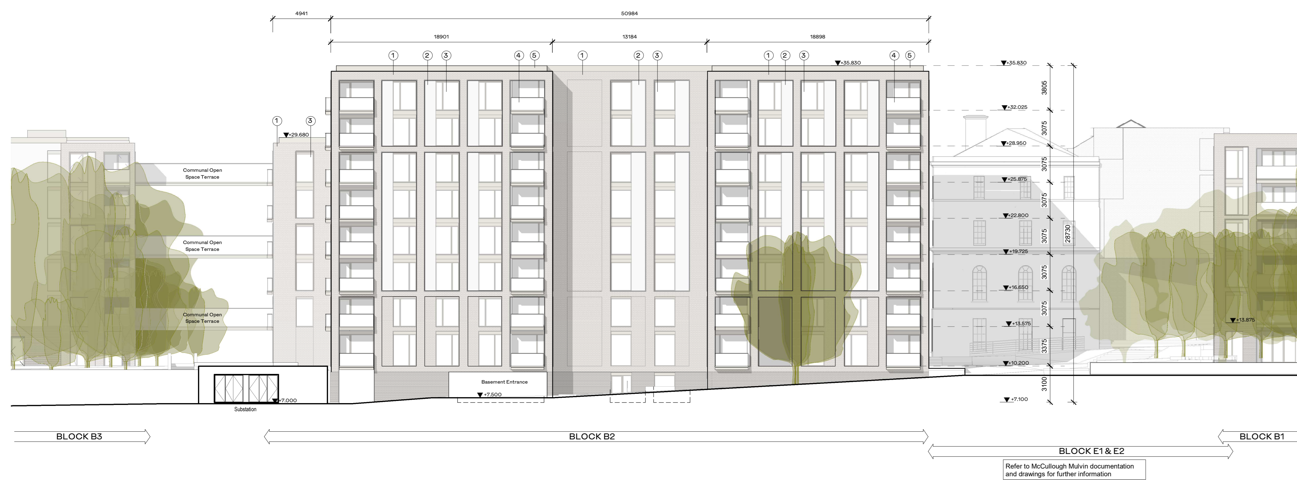
1 Block B2 Proposed North Elevation 1 : 200