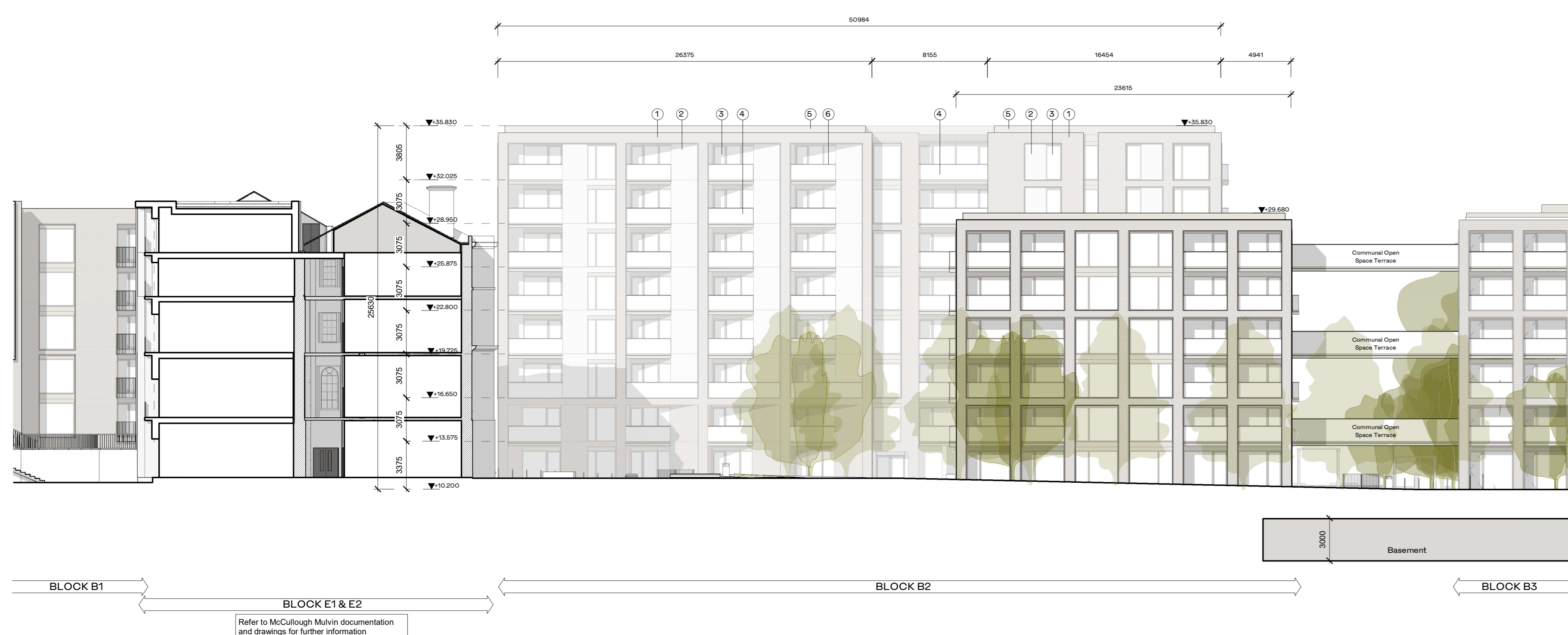
3 Block B2 Proposed South Elevation 1 : 200