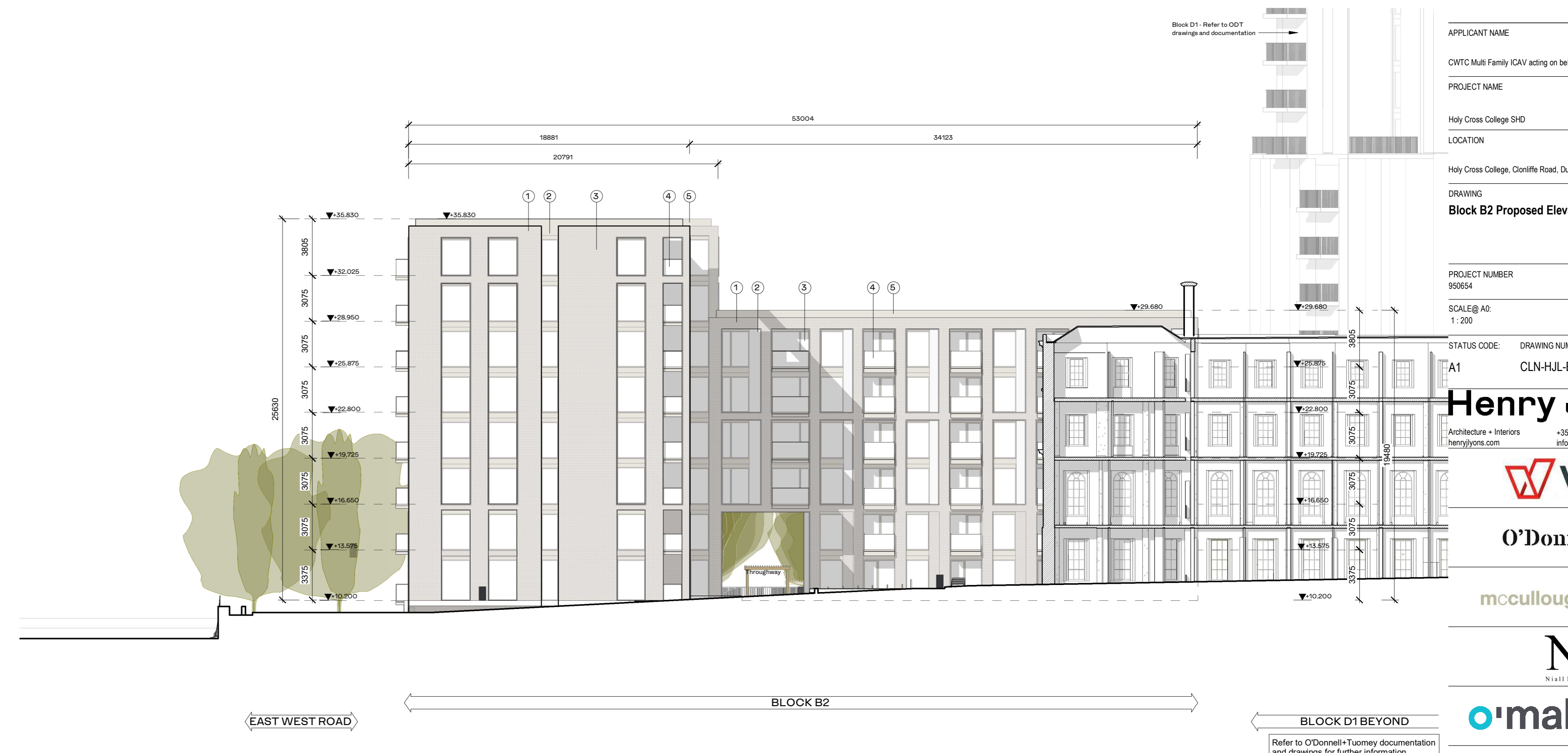
4 Block B2 Proposed West Elevation 1 : 200